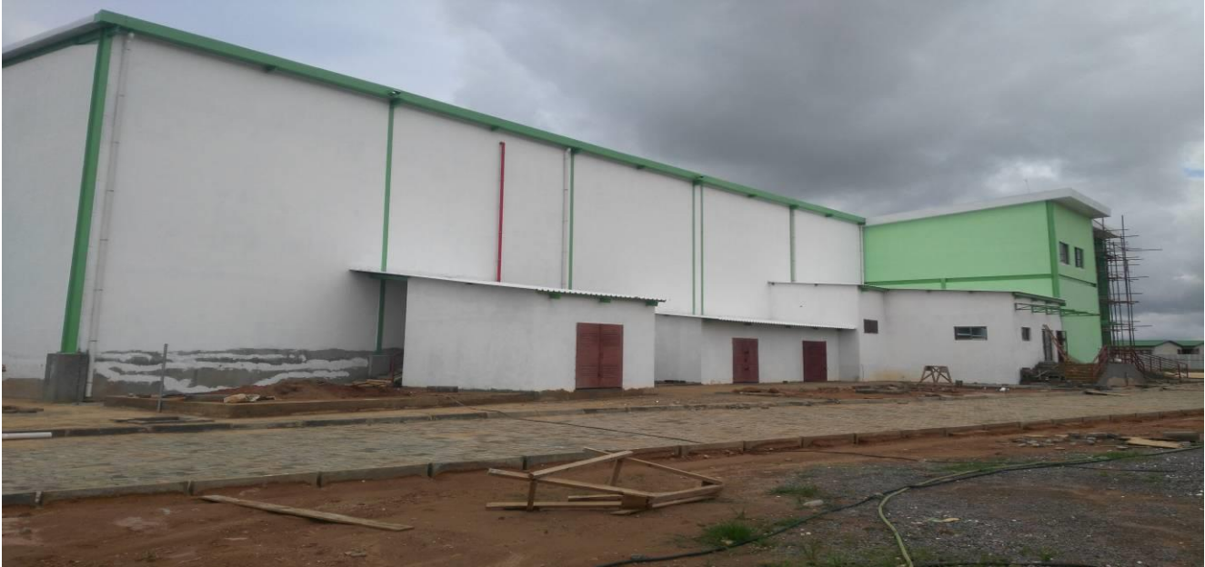
Figure 2: Side view main building externally