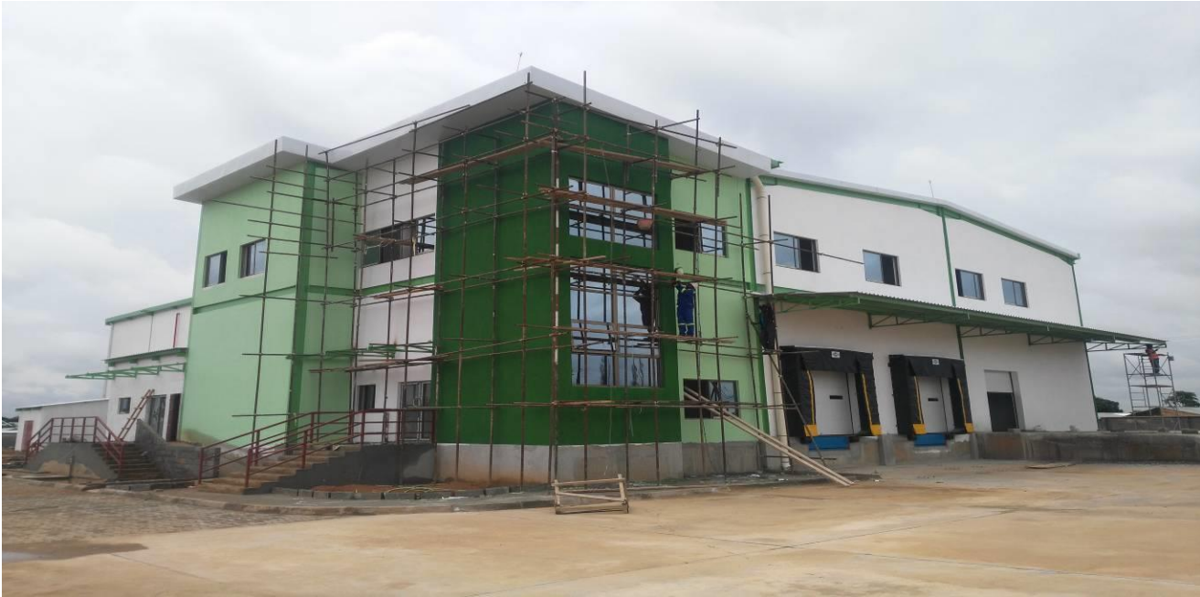
Figure 1: Front view and painting externally

The pictures below show the latest progress of the works on site as at 30/12/17.