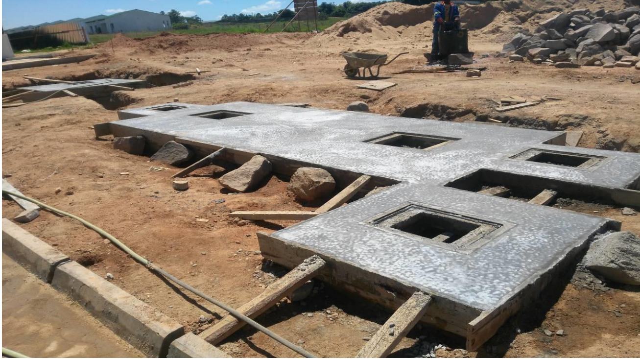
Figure 12: External works