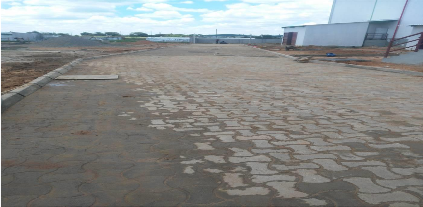
Figure 10: Civil works