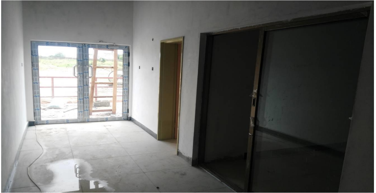
Figure 8: Warehouse main entrance