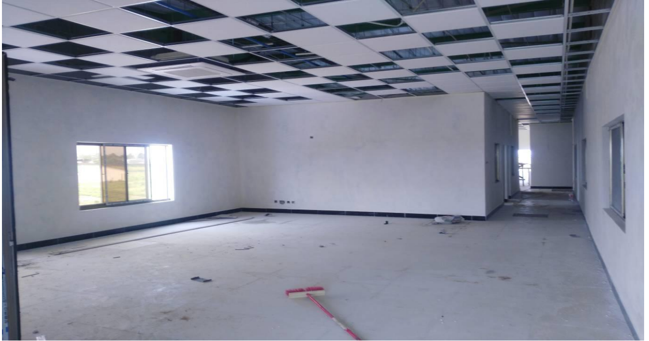
Figure 3: Office building internally