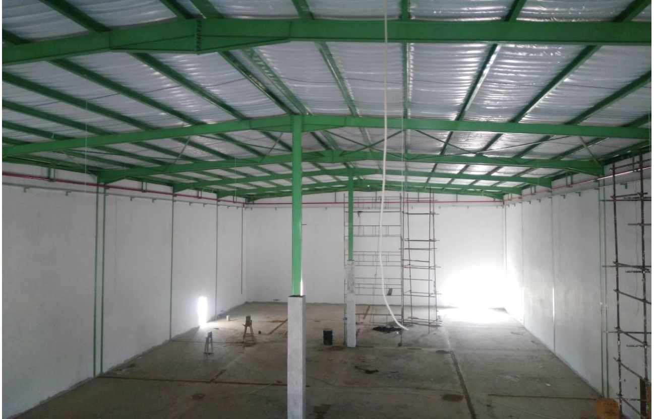
Figure 7: Warehouse internally