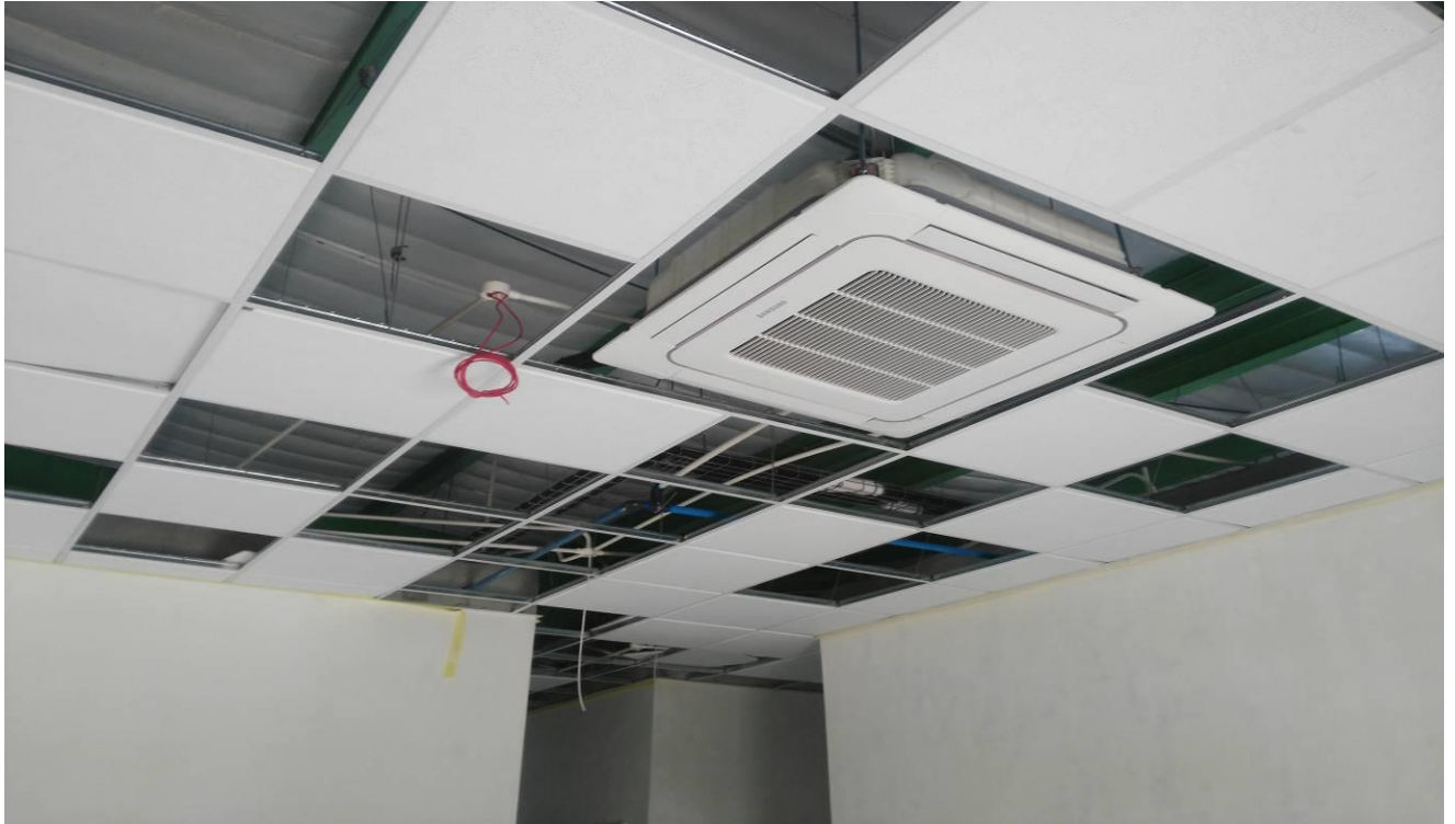
Figure 5: Mechanical installations