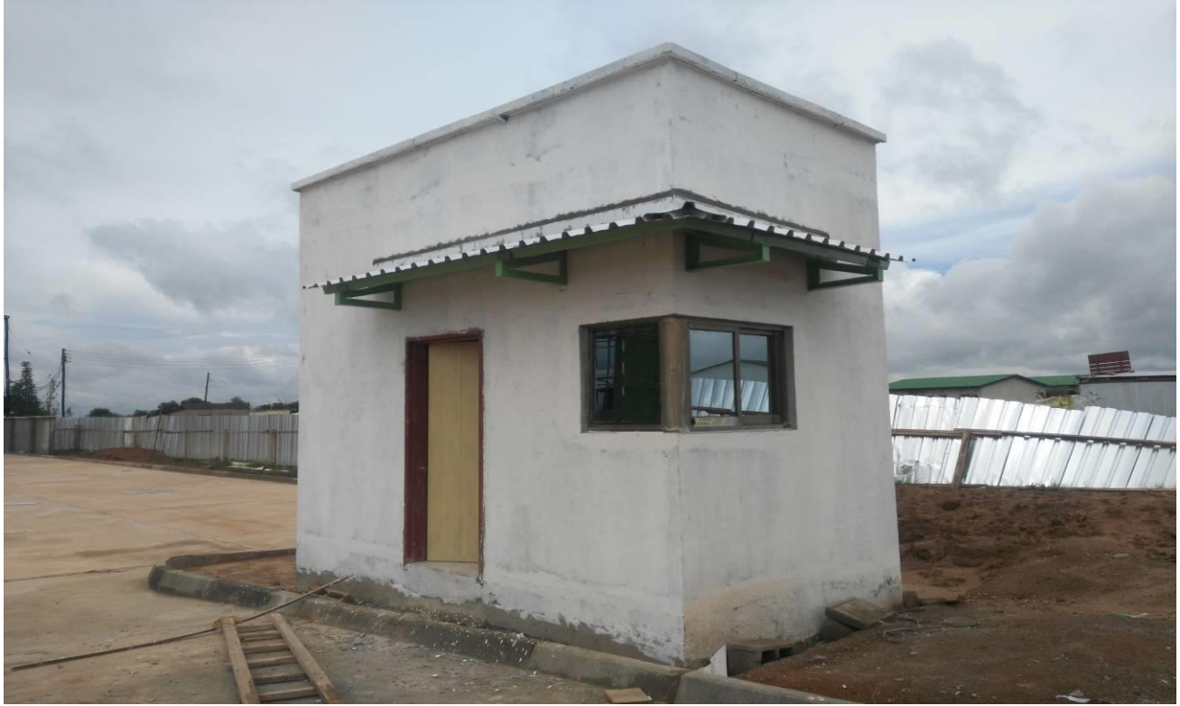
Figure 11: Guard house