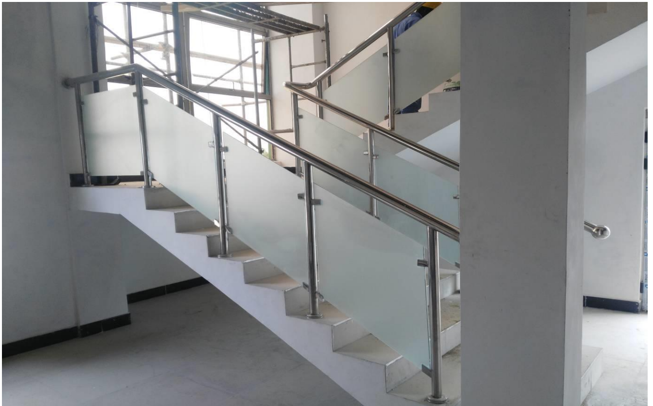
Figure 4: Staircase in the office building