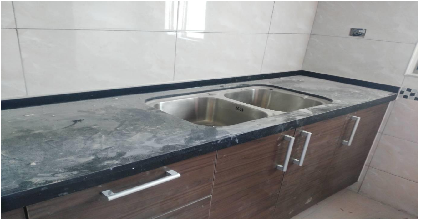
Figure 6: Kitchen units