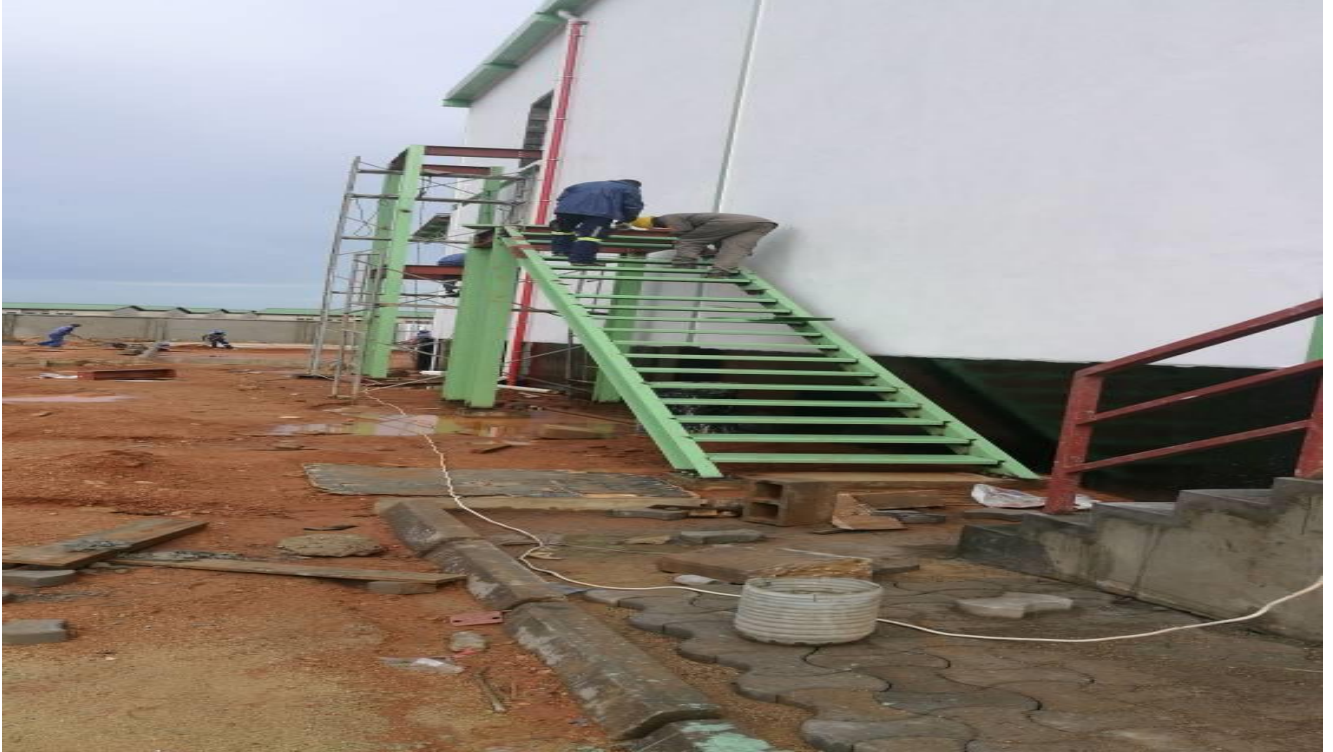
Figure 9: Fire escape staircase